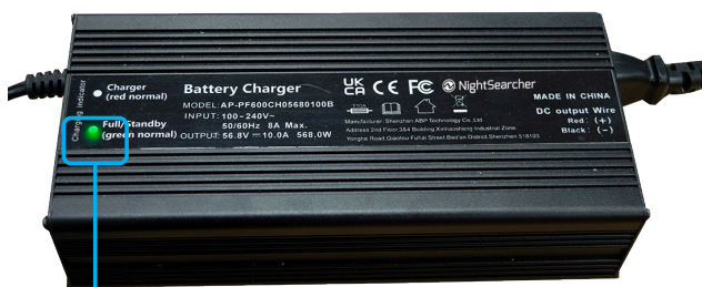
● ● Battery Charging Indicator