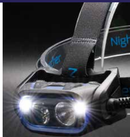
DIFFUSED SIDE LIGHTS

Distance Sensor: Automatic spot to flood sensor